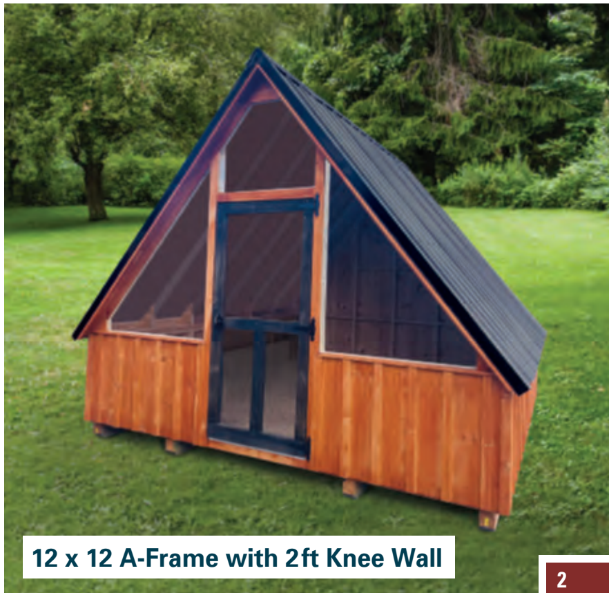
12 x 12 A-Frame with 2ft Knee Wall