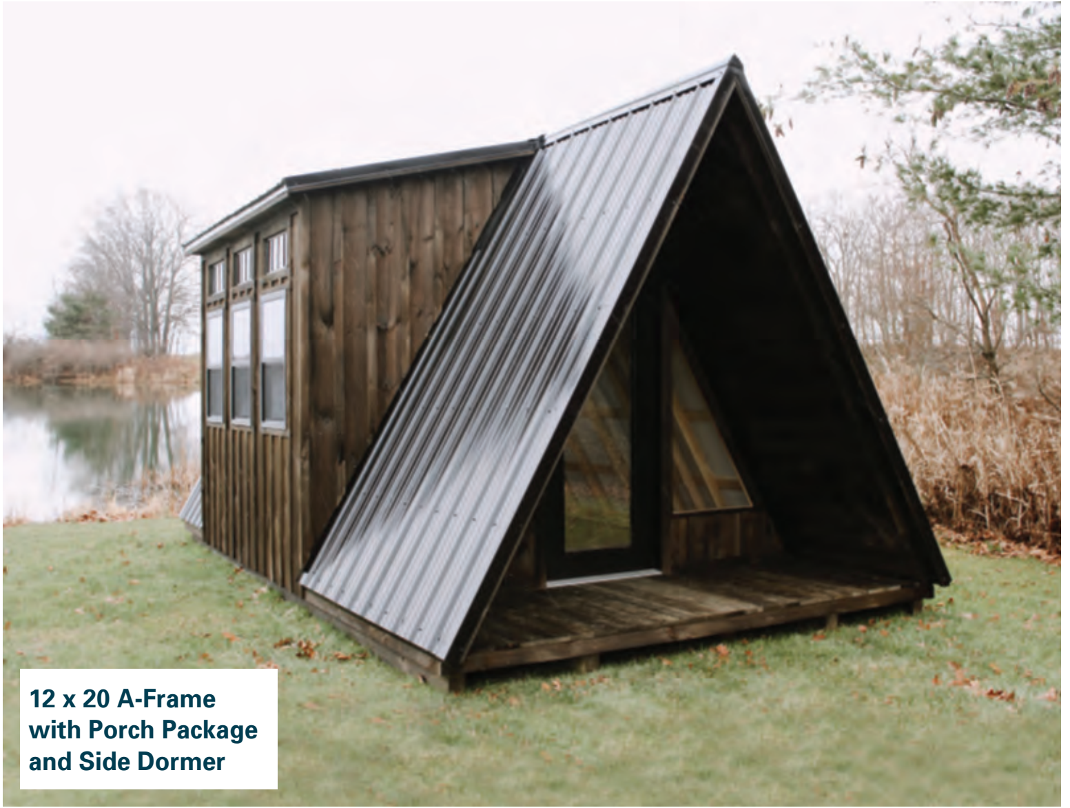
12 x 20 A-Frame with Porch Package and Side Dormer