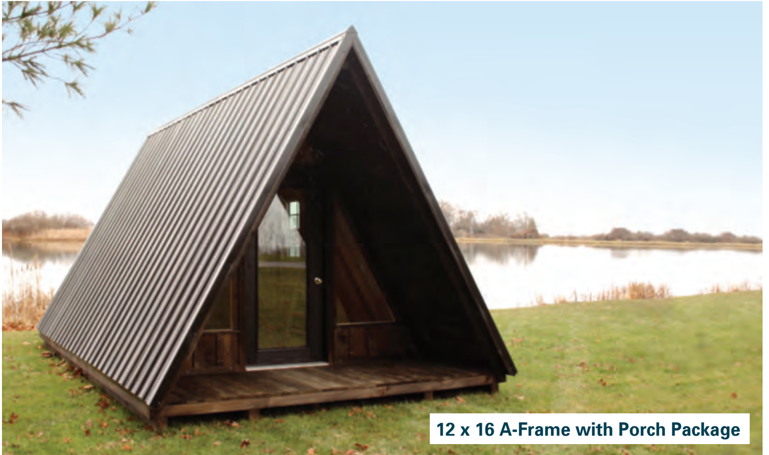
12 x 16 A-Frame with Porch Package