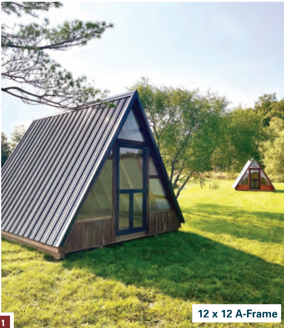
12 x 12 A-Frame