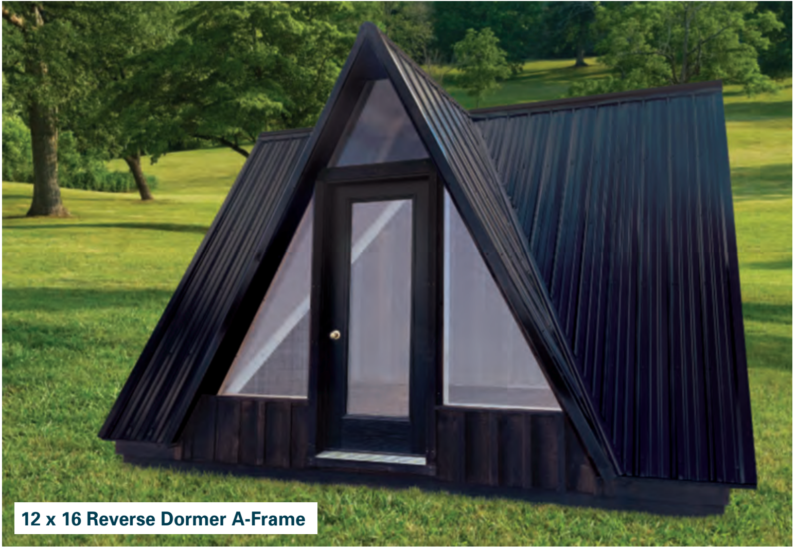
12 x 16 Reverse Dormer A-Frame

Suitable as a storage shed, giving your property a modern, rustic edge.